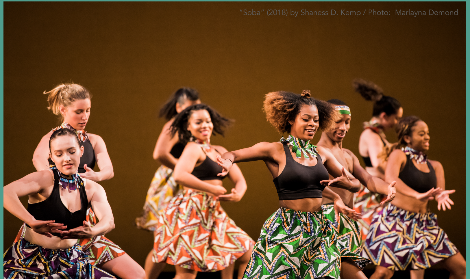
"Soba" (2018) by Shaness D. Kemp / Photo: Marlayna Demond

Is Jazz, Tap, Hip Hop, or Dance Team offered? The department rotates special topics courses that include Intermediate/Advanced Jazz Workshop, Hip Hop Workshop, Tap Dance, African Dance, and other special courses such as Introduction to Indian Dance. Students who are accomplished at Hip Hop are encouraged to explore the UMBC Student Hip Hop crew, Major Definition. Students interested in Ballroom Dance should contact the Ballroom Dance Club, a student organization. The UMBC Dance Team is managed by the Athletic Program.